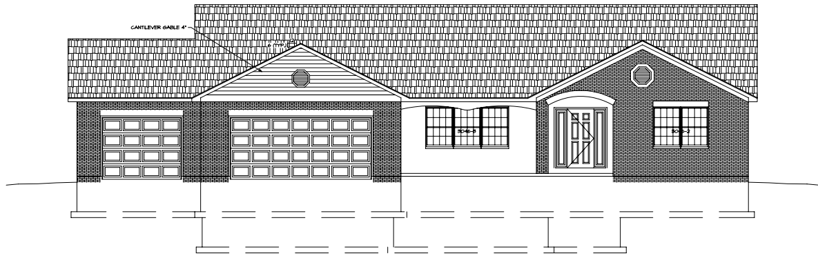
1 FRONT ELEVATION A-1 SCALE: 1/4"=1'-0"